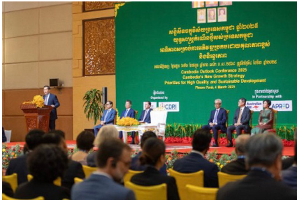
Prime Minister Hun Sen (left) addresses the Cambodia Outlook Conference 2025 on March 4.

The Cambodia Development Research Institute (CDRI) and the Australian embassy in Cambodia co-hosted the March 4 Cambodia Outlook Conference 2025.